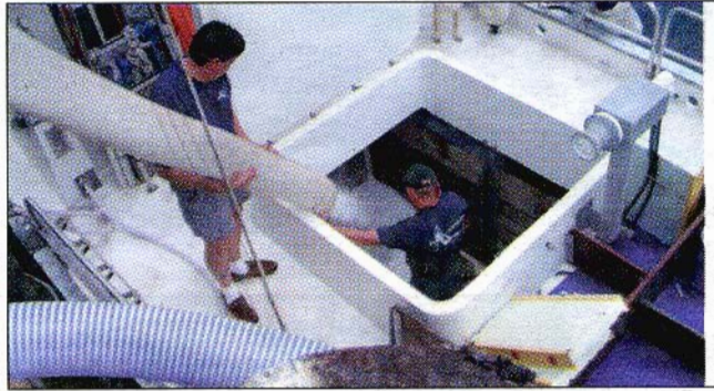
Fishermen at Morro Bay are taking advantage of flake ice after the installation of a North Star Model 60 on the dock.

The North Star plant can make 18 tons of ice a day and store up to 32 tons at a constant 20 deg. F. Ice can be delivered to totes or directly to fishing boats at the rate of quarter of a ton an hour.