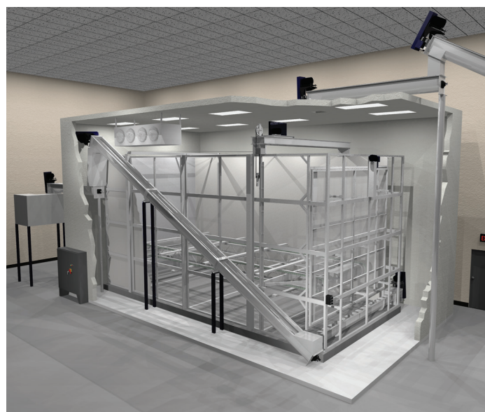
North Star insulated enclosures will fit in existing or new ice plants.